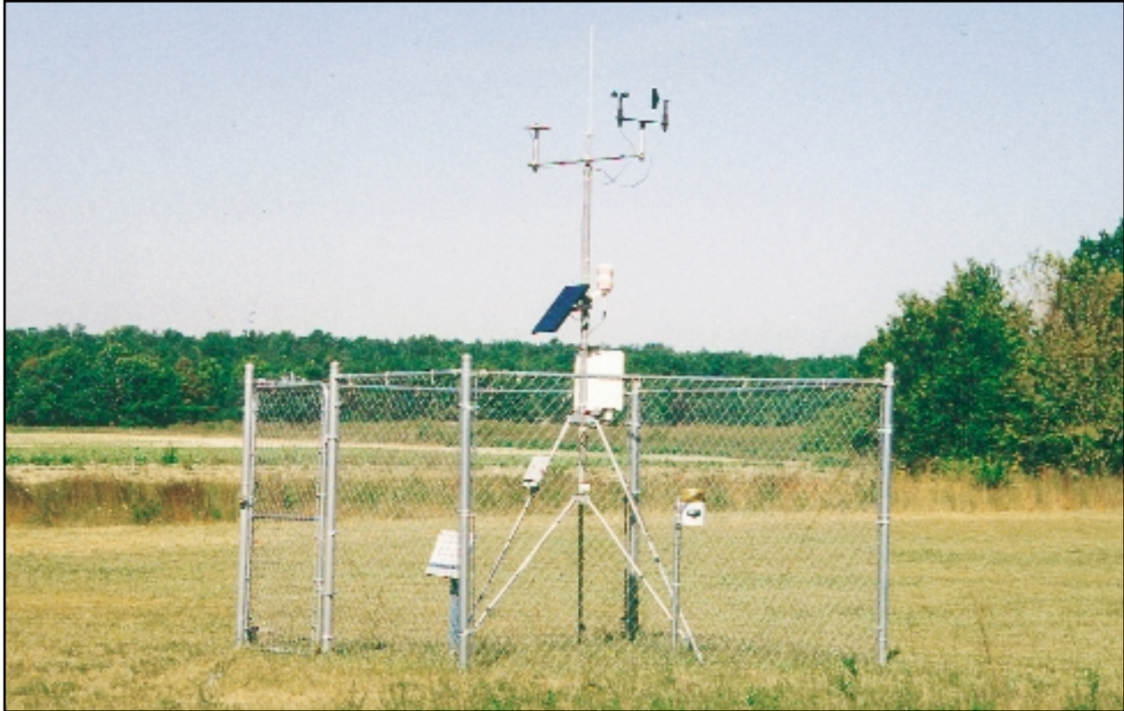
R.I.S.E. station sites provide ample room for wheelchair access and allow school children the opportunity to study the network.