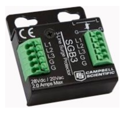
FIGURE 7-1. SGB3 3-line surge protector

The SGB3 is required to protect against electrical surges (FIGURE 7-1 (p. 9)). The CS225 is shipped with the SGB3, a 2-ft cable for connecting the SGB3 to the data logger, and two pan Phillips screws and two grommets for mounting the SGB3 to an enclosure backplate.