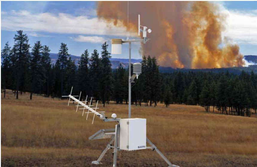
Campbell Scientific's RAWS-F Fire Weather Quick Deployment Station provides accurate measurements in harsh environments. These stations can be set up in less than 10 minutes—without tools.

Campbell Scientific has manufactured thousands of automated weather stations. Our stations are known for their versatility and reliability, even in harsh environments—two features that make them ideal for fire weather monitoring. Several configurations are available, but all our fire weather stations monitor, record, and transmit meteorological data relevant to fire danger prediction.