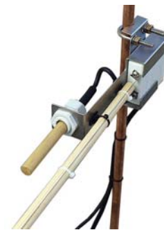
Our CS506 and CS205/107 provide automated fuel moisture and temperature measurements of a 10-hour fuel dowel.