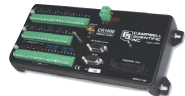
The versatility of our stations stems from the capabilities of our measurement system.