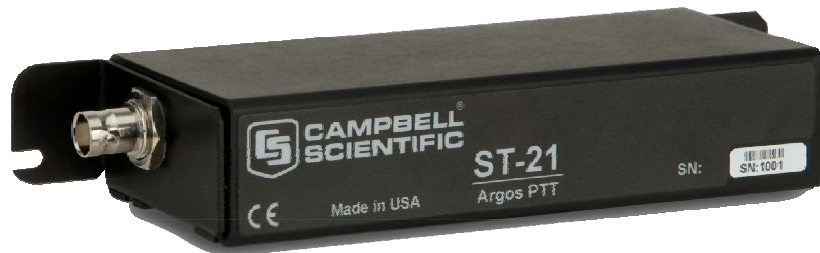
FIGURE 3-1. The ST-21's BNC connector attaches to the antenna via the antenna cable

The ST-21's BNC connector is for attaching the antenna (see FIGURE 3-1).