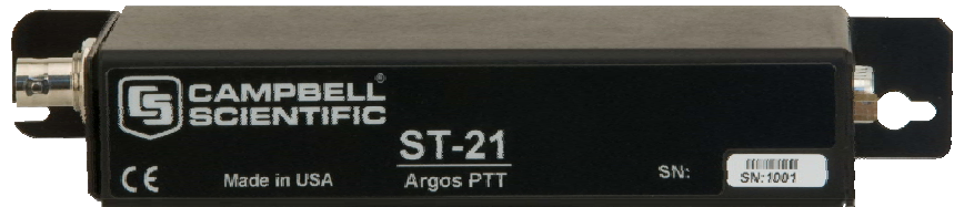
FIGURE 1-1. ST-21 Argos Satellite Transmitter

The ST-21 is a certified Argos PTT satellite transmitter for use with Campbell Scientific CRBasic dataloggers. Service Argos data transceivers fly aboard two NOAA polar orbiting satellites. With an orbit altitude close to 800 kilometers, the satellites are at a relatively low orbit. The low orbit allows for low transmit power, low battery power requirements and the use of an omnidirectional antenna. The orbit period is approximately 1 hour and 45 minutes, which allows hourly data at extreme northern and southern latitudes. Near the equator there are about six satellite passes per day that are not evenly spaced. During the average satellite pass, the satellite is in view for about 10 minutes.