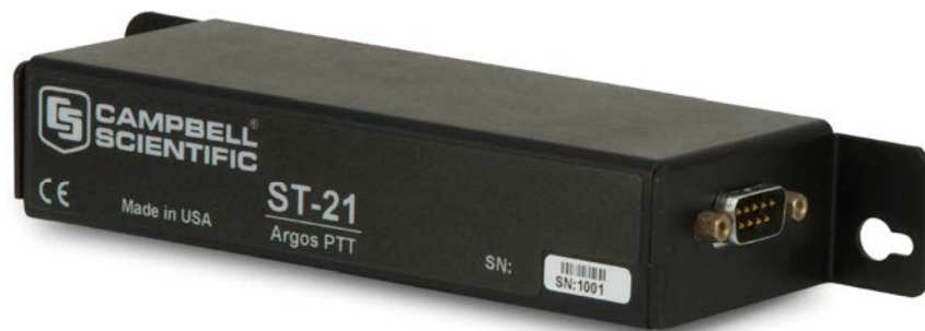
FIGURE 1-2. The ST-21's 9-pin connector attaches to the datalogger via the SC12 cable