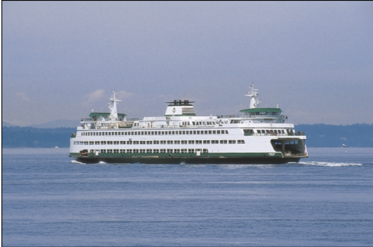
Leaving Edmonds, WA., for Kingston, WA., a ferry both reports and receives weather data every 15 seconds while underway.