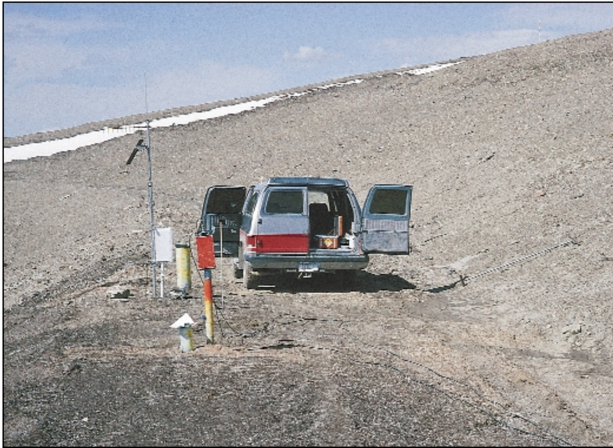
Quarterly site visits are conducted to collect neutron-probe and oxygen-sensor data and to perform routine maintenance.