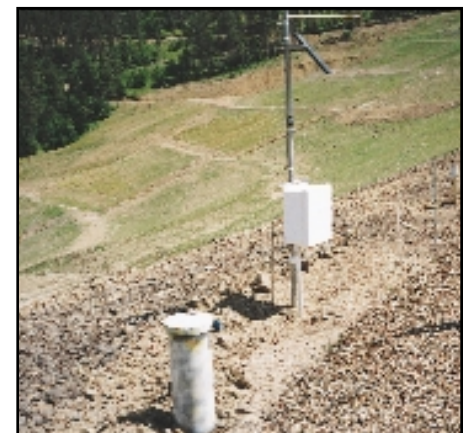
Wireless telemetry, in this case cell phones, simplifies data retrieval from remote areas.