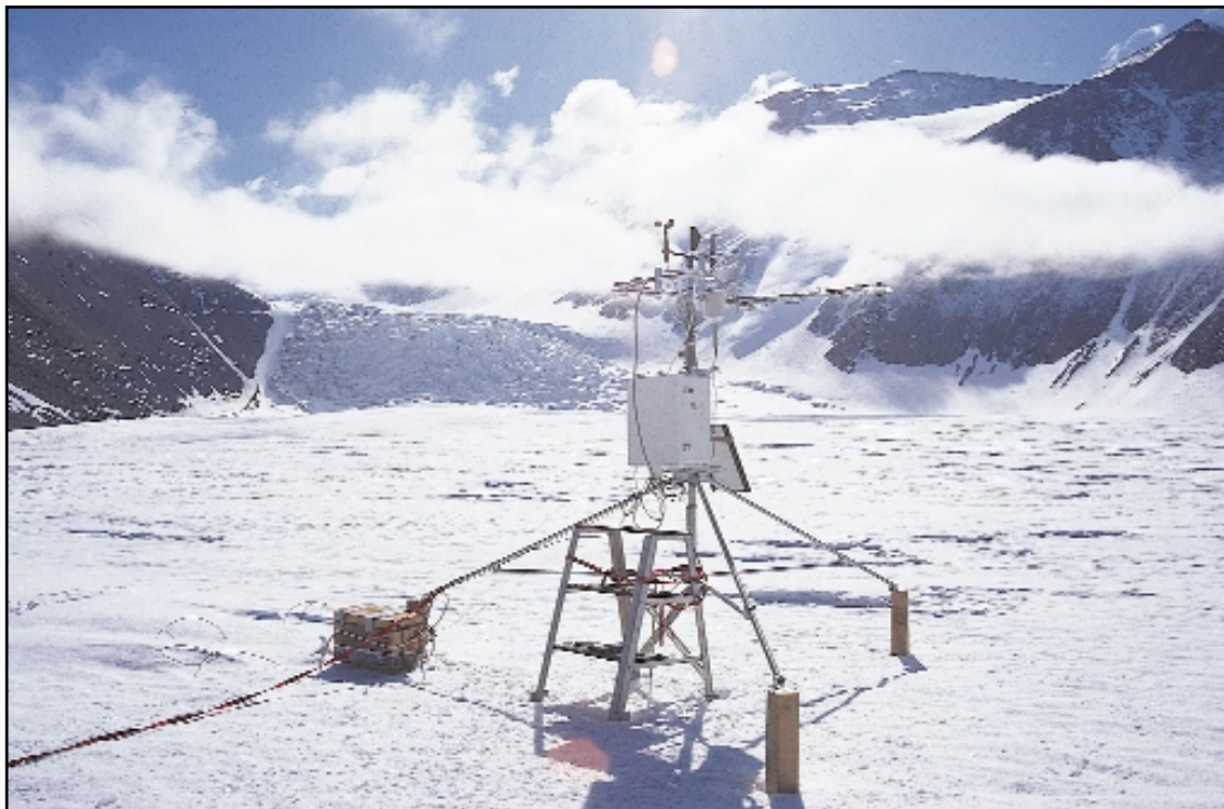
Eddy correlation station provides data for energy balance studies. (Canada Glacier, Taylor Valley, Antarctica).