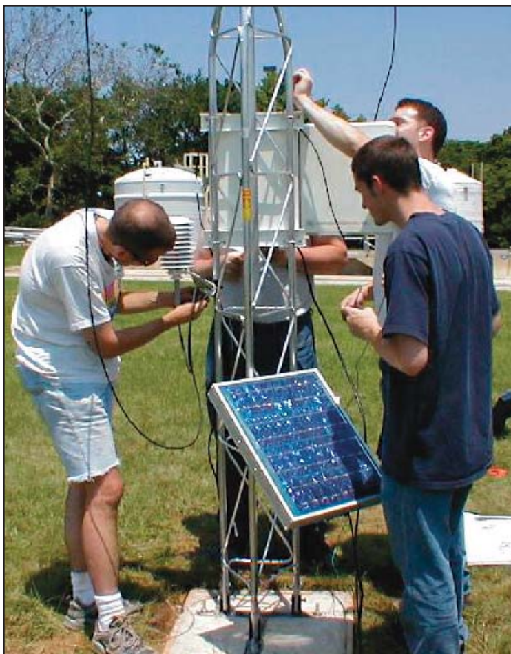
Installing a new DEOS station increases the area covered by the network, and allows graduate students at the University of Delaware to gain experience working with meteorological equipment in the field.