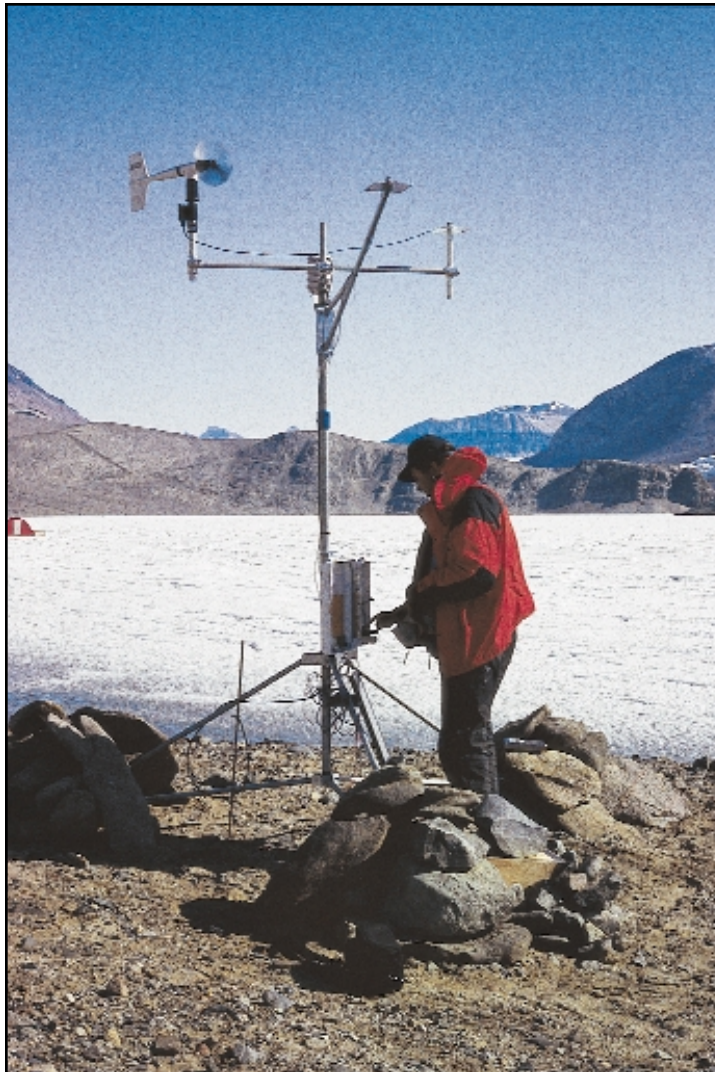
Summer reaches the Antarctic, providing an opportunity to visit a "balmy lakefront" site.