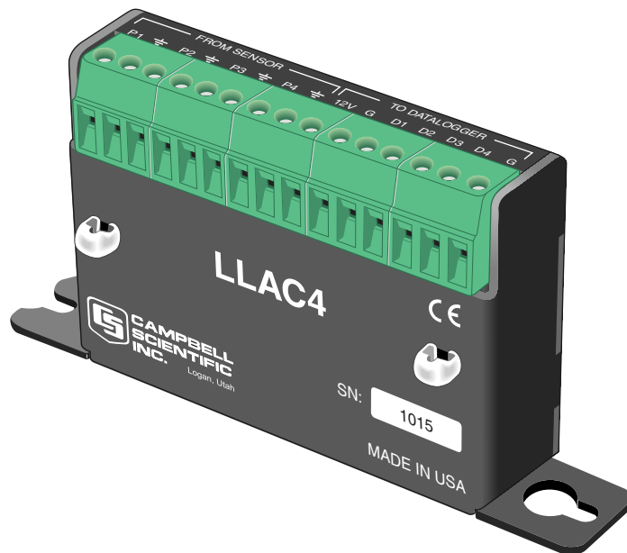
FIGURE 1. LLAC4 Four-Channel, Low-Level AC Conversion Module

The LLAC4 is often used to measure up to four anemometers, and is especially useful for wind profiling applications. Compatible wind sensors include, but are not limited to, the 05103 Wind Monitor, 05106 Wind Monitor-MA, 05305 Wind Monitor-AQ, 03001 Wind Sentry Set, and 03101 Wind Sentry Anemometer.