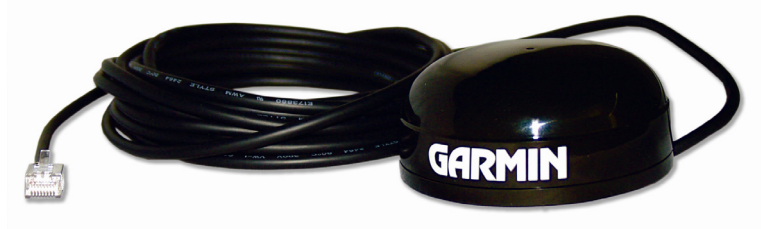
FIGURE 1. Garmin 16-HVS GPS Receiver, Part Number 17215