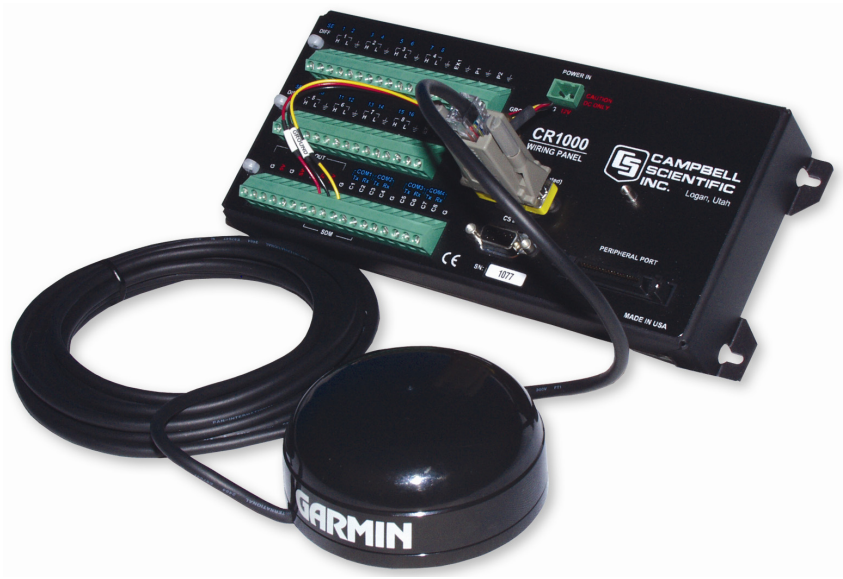
FIGURE 3. CR1000 to GPS16-HVS Using the 17218 Adapter