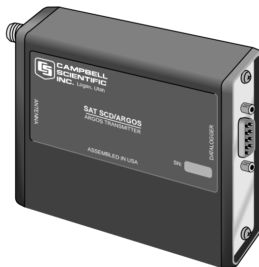
FIGURE 1-1. SAT SCD/ARGOS

The SAT SCD/ARGOS PTT supports up to four Argos ID numbers and four SCD2 ID numbers. Message repeat intervals, ID numbers and duty cycles can be changed with a simple-to-use computer-based interface. The transmitter connects directly to the CS I/O port using the standard SC12 ribbon cable. All power and input/output connections with the datalogger are through the CS I/O port. Power requirements can be as low as 2 mA average current drain. After power is applied, the PTT will start to transmit at the repeat interval. If the datalogger has not sent data to the transmitter, a default message is sent. During configuration, transmissions are disabled. Program instruction P125 is used to send final storage data to the transmitter. The CR10X datalogger supports the SAT SCD/ARGOS.