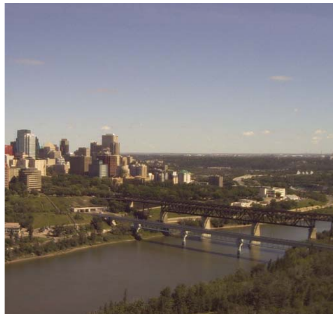
Above is a photograph taken by the CC5MPX camera. Campbell Scientific Canada installed the camera high above Edmonton's spectacular river valley on the University of Alberta's H.M. Tory Building. The camera records visual weather conditions every 15 minutes and transfers the image via FTP to a local server.

The Ethernet cable connects the camera to a network router, cellular modem, or laptop. This connection allows access to a web interface used for camera configuration, targeting, and focusing. System status, date, time, and other information are also displayed on the web interface.