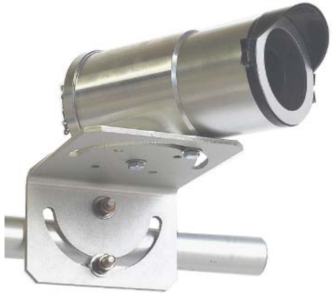
The 18549 mounting bracket kit fastens the camera to a CM202, CM204, or CM206 crossarm. Curved notches in the bracket allow the camera to be aimed at the desired target.

Designed to work in harsh environments, the cameras can operate at temperatures as low as -40°C and as high as 60°C. They have an integrated environmentally sealed enclosure that protects them from moisture and high-humidity. Additionally, the CC5MPXWD includes an window defroster that prevents and removes light frost and icing* from the camera's window.