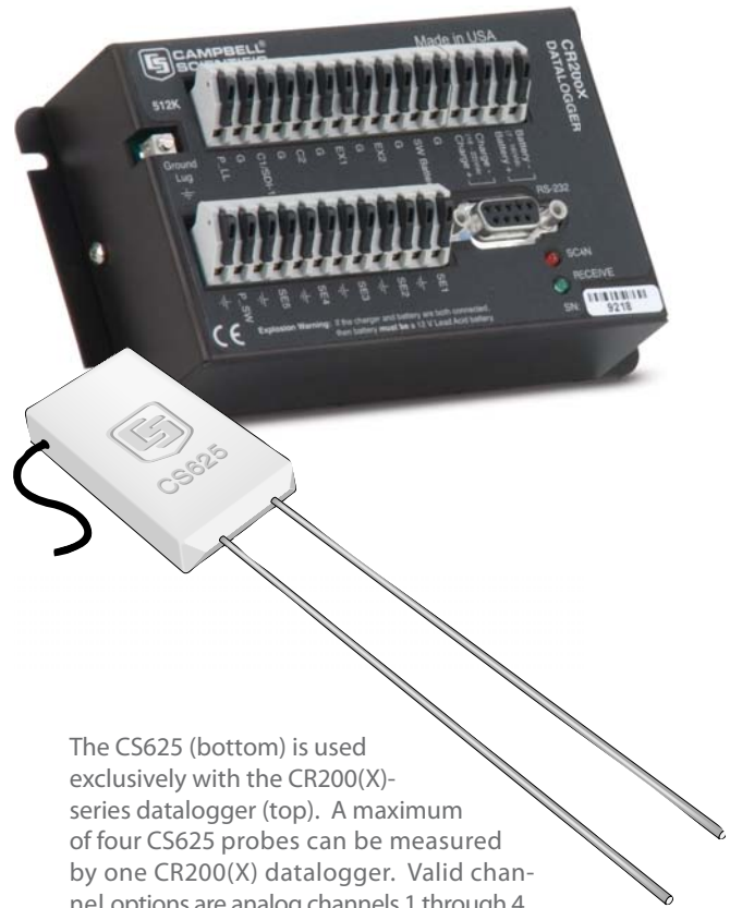
The CS625 (bottom) is used exclusively with the CR200(X)-series datalogger (top). A maximum of four CS625 probes can be measured by one CR200(X) datalogger. Valid channel options are analog channels 1 through 4.

The differentially-driven probe rods form a transmission line with a wave propagation velocity that is dependent on the dielectric permittivity of the medium surrounding the rods. Nanosecond risetimes produce waveform reflections characteristic of an open-ended transmission line. The return of the reflection from the ends of the rods triggers a logic state change which initiates propagation of a new wavefront. Since water has a dielectric permittivity significantly larger than other soil constituents, the resulting oscillation frequency is dependent upon the average water content of the medium surrounding the rods. The megahertz oscillation frequency is scaled down and easily read by a Campbell Scientific CR200(X)-series datalogger.