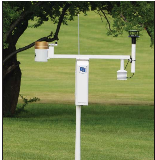
The ET107 provides real-time weather measurements and calculates ET o on an hourly and daily basis.

The ET107 can be programmed in minutes using VisualWeather software (requires version 3.0 or higher). VisualWeather software supports programming, manual and scheduled data retrieval, and report generation. The software also includes on-board equations that calculate ET o , crop water needs, growing degree days, wet bulb temperature, dew point, wind chill, and chill hours.