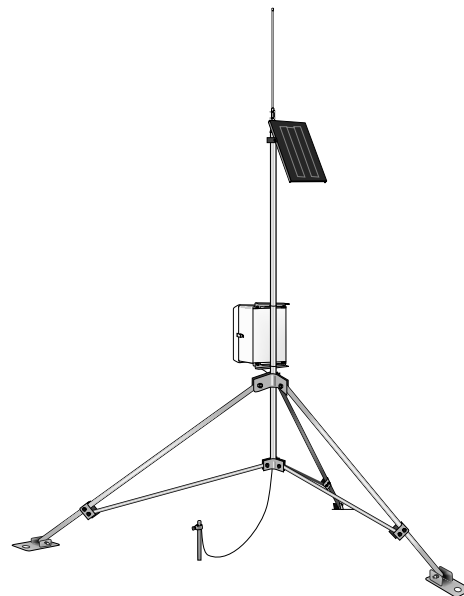
Repeater stations act as communication relays between stations that cannot communicate directly due to distance or obstacles. Repeater stations always use omnidirectional antennas.