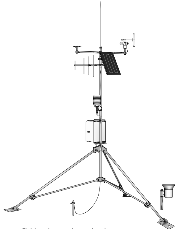
Field stations are located at the measurement site. This field station uses a Yagi antenna to transmit the data.