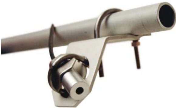
The SI-111 is mounted to a CM204 crossarm via the CM230; the CM230 allows the sensor to be pointed at the surface of interest.

The SI-111 is often mounted to a CM202, CM204, or CM206 crossarm, a tripod or tower mast, or a user-supplied pole via a CM220 Right Angle Mount or CM230 Adjustable Inclination Mount. The SI-111 should be mounted perpendicular to the target surface. Therefore, the CM230 mount is recommended when the target surface is on an incline. The SI-111 may also be mounted directly to a user-supplied camera tripod.