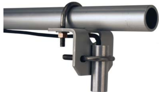
The SI-111 is mounted to a CM204 crossarm via the CM220 Right Angle Mount.