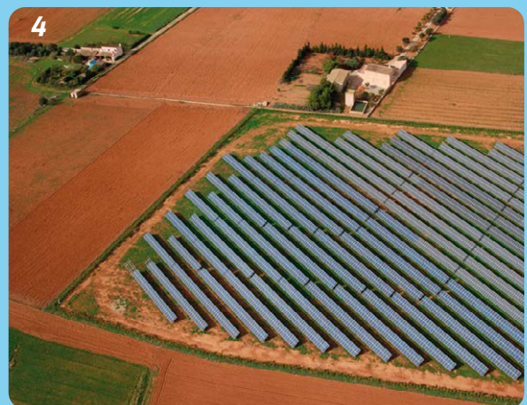
1. Project PEGASE of CNRS-PROMES in the Pyrenees of France. 2. Solar thermal collector testing site of the University of Jyväskylä Renewable Energy Research and Education Program. 3. and 4. Solar farms in Palma de Mallorca. Owner: AFFIRMA. Engineered and installed by ELECINOR