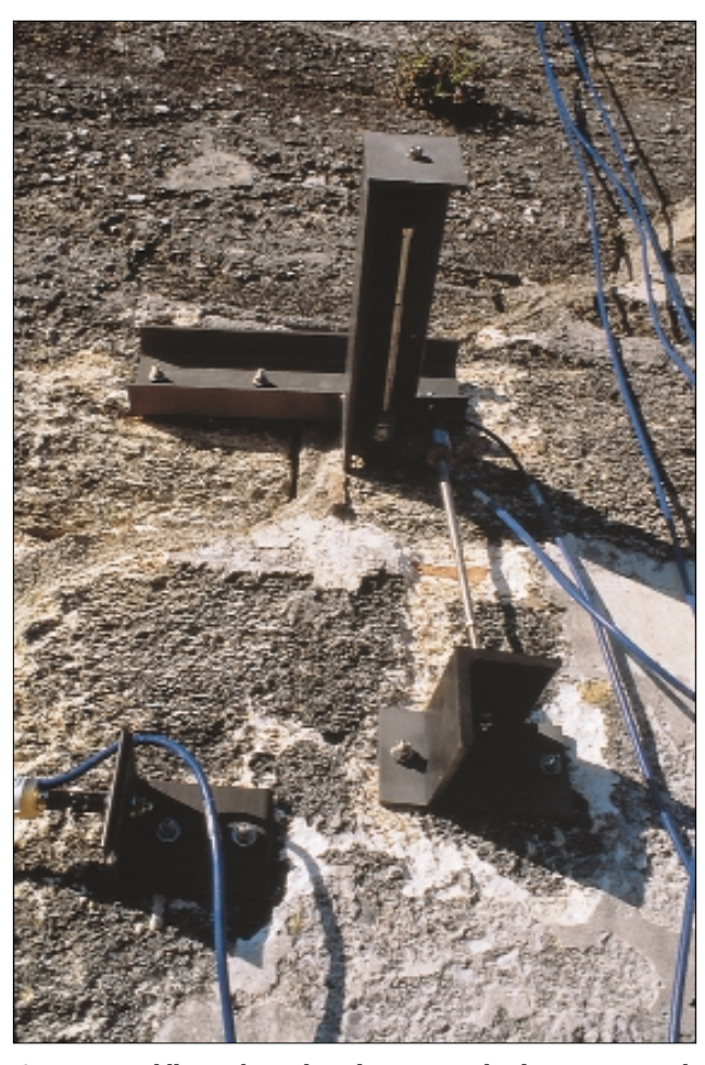
Sensors straddle cracks to directly measure displacement in each of three axes.

Campbell Scientific provided the datalogger, multiplexers, weather stations, and soil moisture probes. The equipment was integrated with crack and tilt sensors.