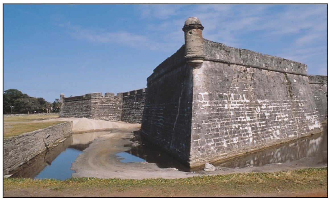
Castillo de San Marcos National Monument, St. Augustine, Florida. Taken in 1995, this view looks across the moat toward the southwest bastion, where several major cracks are visible.