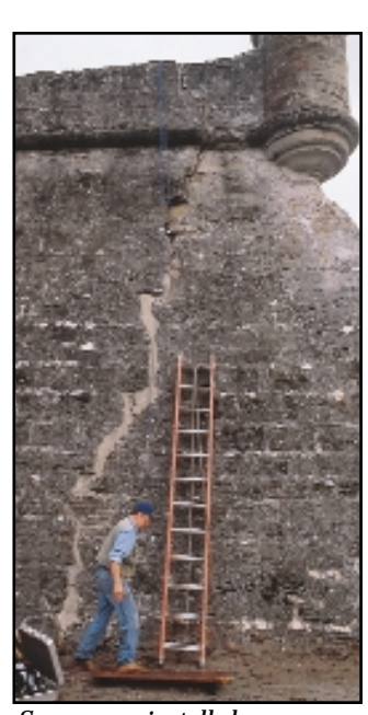
Sensors are installed across a crack in the southwest bastion.

Campbell Scientific equipment helps to preserve and restore an historic monument