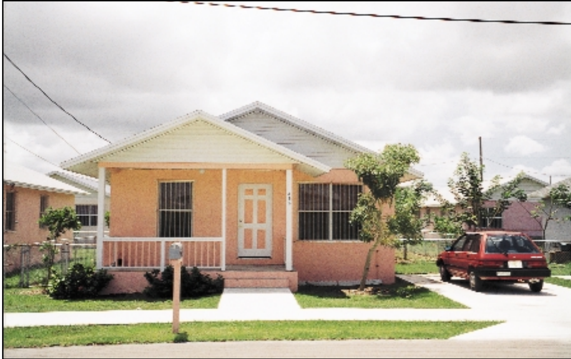
Habitat for Humanity is building nearly 150 new homes for low-income victims of Hurricane Andrew. The goal of the project is an energy-efficient neighborhood to stand as a benchmark of affordable housing in Florida.

Campbell Scientific CR10s monitor new homes in a Florida neighborhood