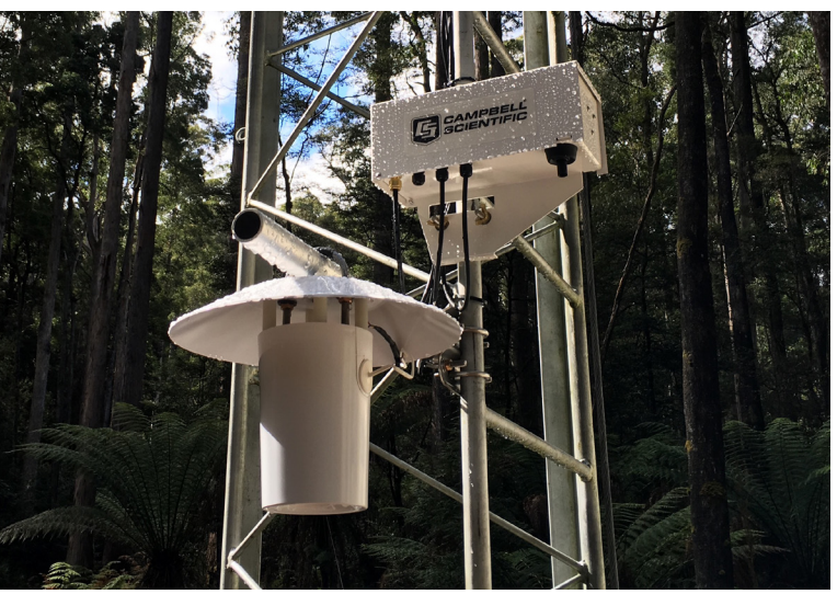
One of the AP200 intakes and the aspirated temperature probes