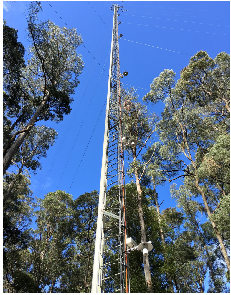
Looking up at the Warra Flux Tower. Several of the AP200 intakes can be seen. The CPEC200 is mounted at the top.

The Warra long-term ecological research (LTER) site located in Southwestern Tasmania was founded in 1995 to monitor long-term ecological health and dynamics within a wet eucalyptus forest. The site area consists of 15,900 hectares (61.4 square miles), partly contained within the Tasmanian Wilderness World Heritage Area (managed for conservation) and partly within state forest (managed for multiple uses, including timber production). Studies at the site have the following main research objectives: