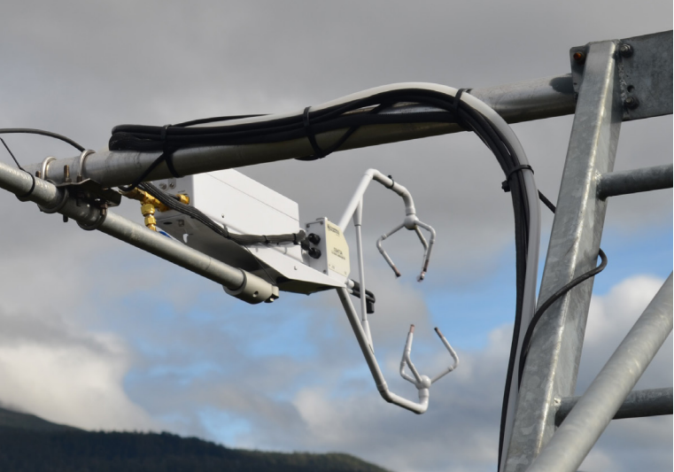
The CPEC200 with vortex intake at the top of the 80-m Warra flux tower

AMPRELL PO Box 8108 | Garbutt Post Shop QLD 4814 | +61 (0)7 4401 7700 | www.campbellsci.com.au