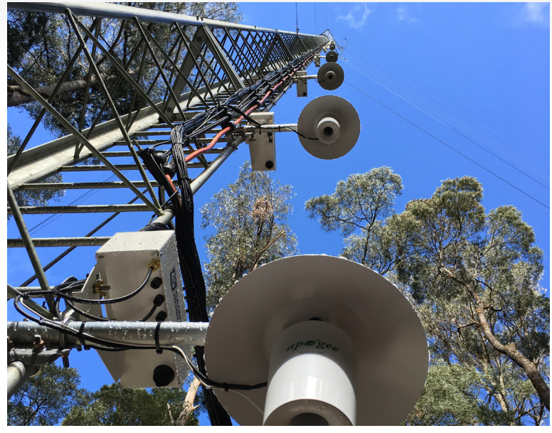
AP200 intakes and temperature probes on the Warra flux tower

Related websites: www.supersites.net.au/supersites/wrra www.ozflux.org.au/monitoringsites/warra/index.html www.forestrytas.com.au/understanding-our-forests/our-research/warra-long-term-ecological-research