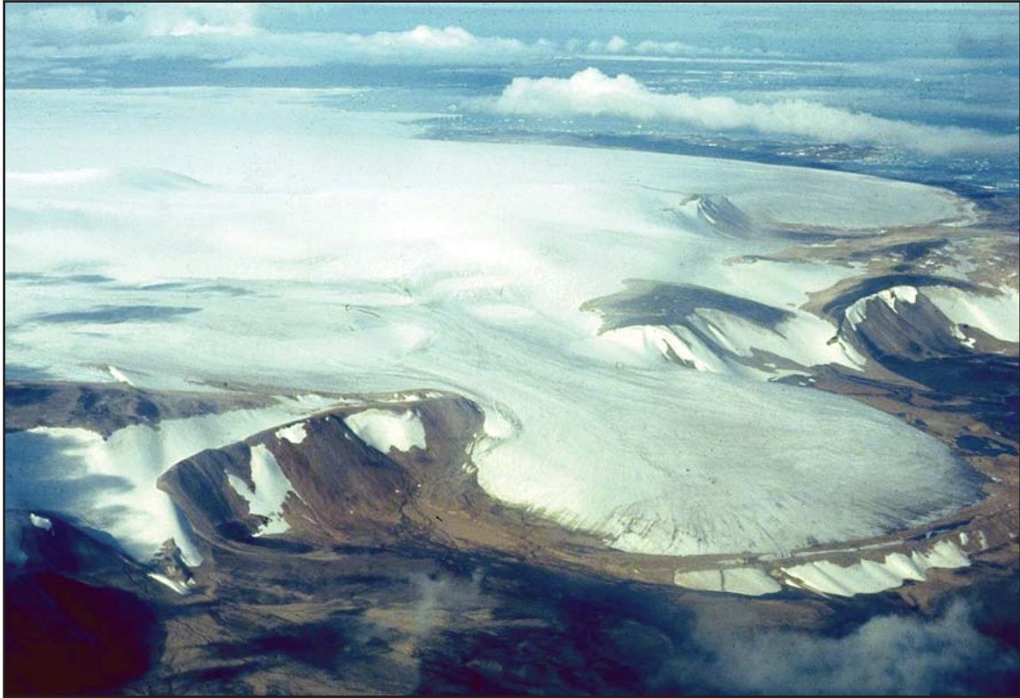
The southern edge of Devon Island Ice Cap in Nunavut, Canada, lies within the research area, where long-term data are being collected to study global warming.