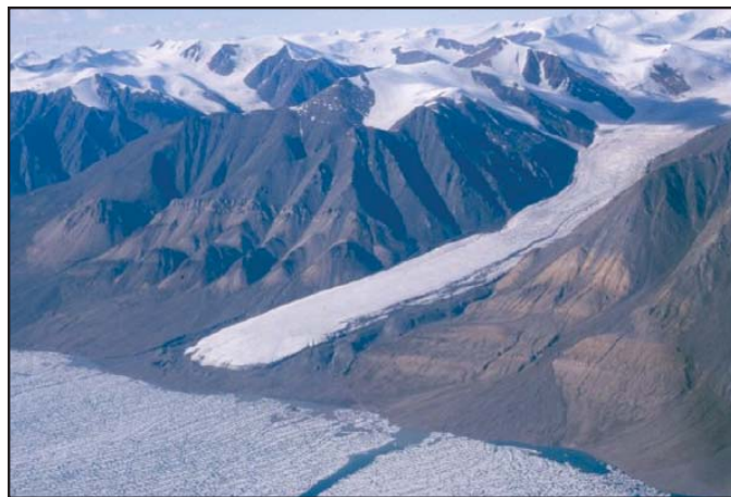
Greely Fjord, on Ellesmere Island, Nunavut, Canada, is part of the Campbell Scientific network within the High Arctic Islands.

The climate at Alert, typical of the cold polar desert climate seen throughout most