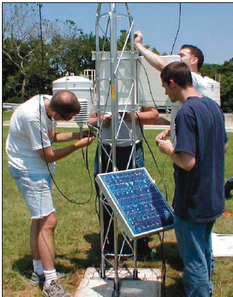
Installing a new DEOS station increases the area covered by the network, and allows graduate students at the University of Delaware to gain experience working with meteorological equipment in the field.