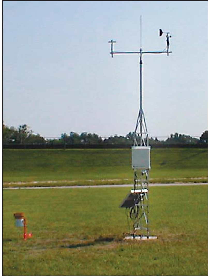
DEOS sites span parts of three states and provide data for emergency management and environmental monitoring.

Measured/calculated parameters: Air temperature, barometric pressure, rela- tive humidity, precipitation, soil moisture, soil temperature, solar radiation, snow depth, water temperature, wave height and period, wind speed and direction.