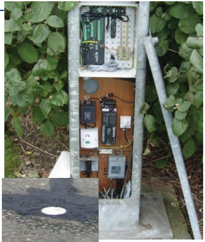
Inset—IRS21 road sensor; large photo—instruments inside AWS

With the IceWatch system, the Eurotunnel staff now has state-of-the-art equipment and displays to quickly and clearly show them the road and weather conditions at their terminals. They can make informed operational decisions to maintain site safety and reduce costly disruption.