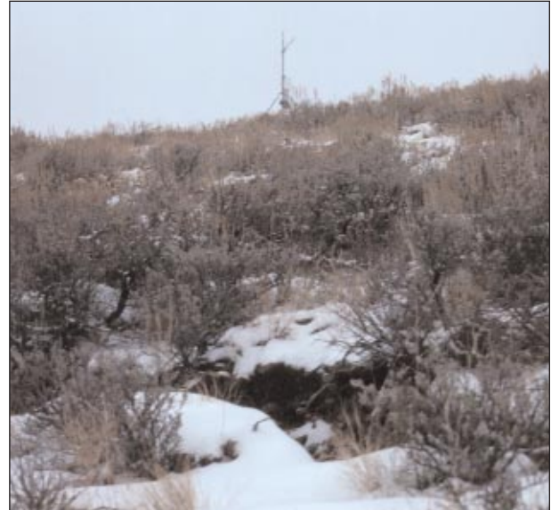
View upslope across fissure system (foreground) to measurement station.

The Problem: Our customer required a data acquisition and control system to monitor a slowly moving slope, detect any significant movement, and trigger alarms to alert personnel working at the base of the slope. The system needed to withstand environmental extremes, operate from a self-contained power supply, and transmit data via radio to both an alarm control station and a computer base station. In the slope's history, catastrophic failures were precursed by gradually rising rates of slippage, so the system had to detect, record, and respond to both short- and long-term (cumulative) movements.