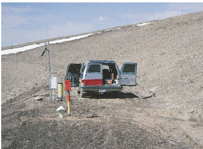
Quarterly site visits are conducted to collect neutron-probe and oxygen-sensor data and to perform routine maintenance.

To read more case studies, visit the Case Study Library at www.campbellsci.com/case-studies .