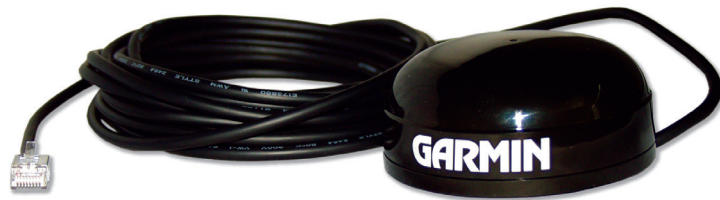
FIGURE 1-1. Garmin 16-HVS GPS Receiver, Part Number 17215

The Garmin16-HVS is a complete GPS receiver manufactured by Garmin International, Inc. The Garmin16-HVS has been configured by Campbell Scientific, Inc. (CSI) to work with CSI dataloggers.