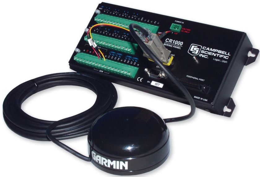
FIGURE 2-2. CR1000 to GPS16-HVS Using the 17218 Adapter