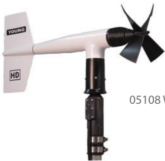
05108 Wind Monitor-HD