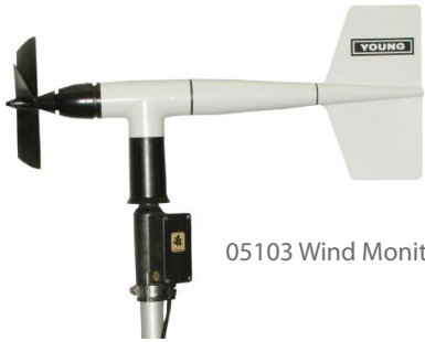
05103 Wind Monitor