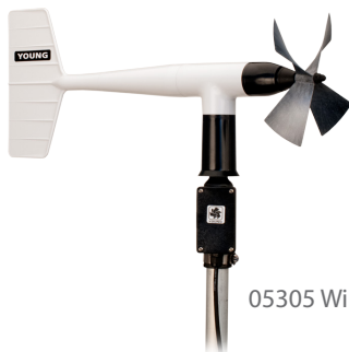
05305 Wind Monitor-AQ