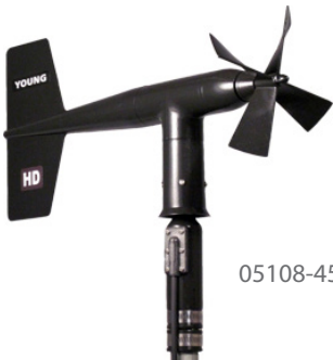
05108-45 Wind Monitor-HD-Alpine