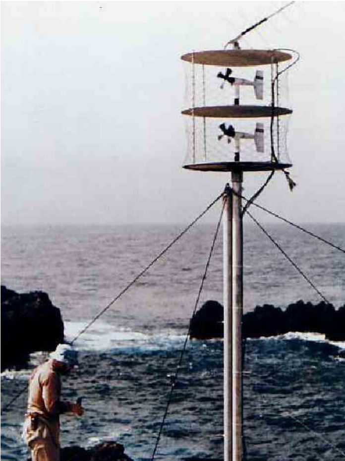
An innovative method of discouraging interference from birds was used at a station at St. Peter and St. Paul Rocks (Brazil).