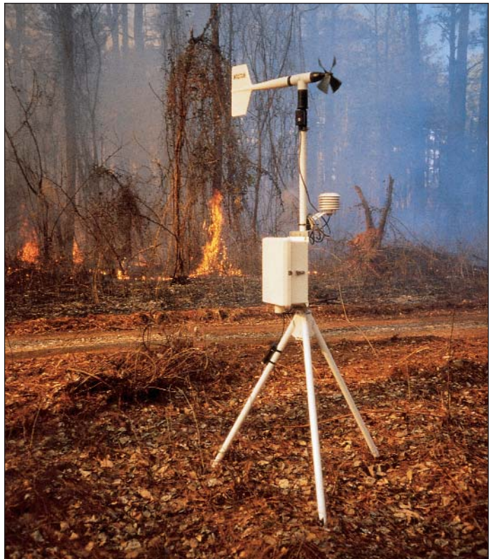
The CR510 supports many applications including the monitoring of fire conditions.

Built with surface-mount technology, the CR510 is a small (8.4" x 1.5" x 3.9"), lightweight (15 oz.) datalogger.