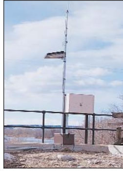
Up to 254 sites can be interrogated over a UHF or VHF frequency.

Telecommunication options include multidrop and short-haul modems, radios (UHF, VHF, spread spectrum), telephones (including cellular and voice-synthesized), and satellite transmitters.