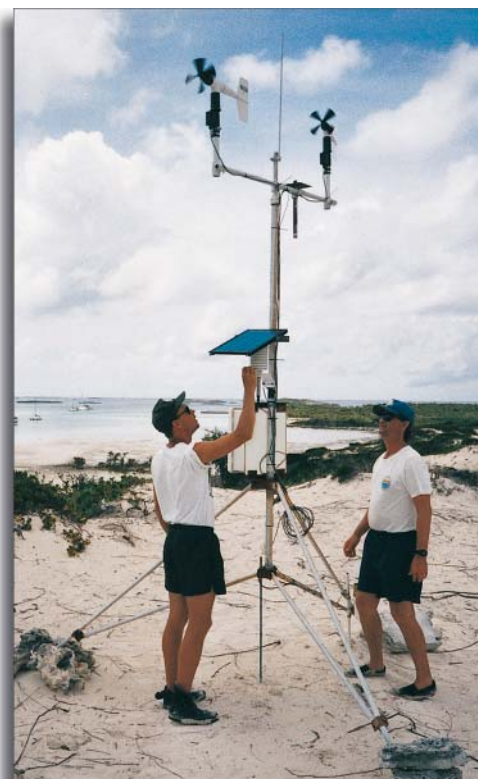
A weather station provides data for marine ecology research in the Bahamas.

Our PC-based support software simplifies the entire monitoring process, from programming and data retrieval to data display and analysis. Our software automatically manages data retrieval from networks or single stations. Robust error-checking ensures data integrity. We can even help you post your data to the Internet.