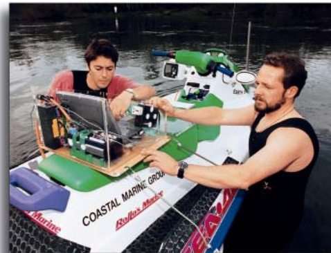
The goal of a research project in the Estuary of Auckland, New Zealand is to model the effects of cooling water discharges.