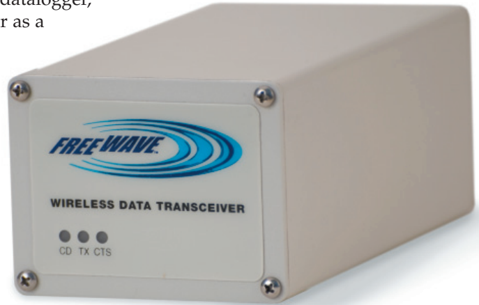
LEDs on the front of the FGR-115RC indicate when the radio is communicating.