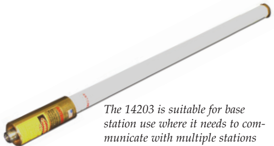
The 14203 is suitable for base station use where it needs to communicate with multiple stations located in different directions.