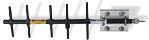
The 14201 Yagi antenna is intended for longer transmission distances.