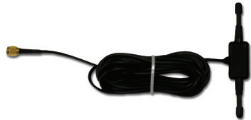
The 15970 has adhesive backing to allow it to adhere to a wall, rear-view mirror, or other suitable flat non-conductive surface.