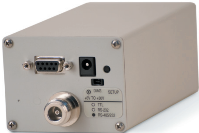
The back of the FGR-115RC shows the 9-pin, RS-232 connector for attaching a datalogger and the coaxial connector for attaching the antenna cable or 18686 adapter.