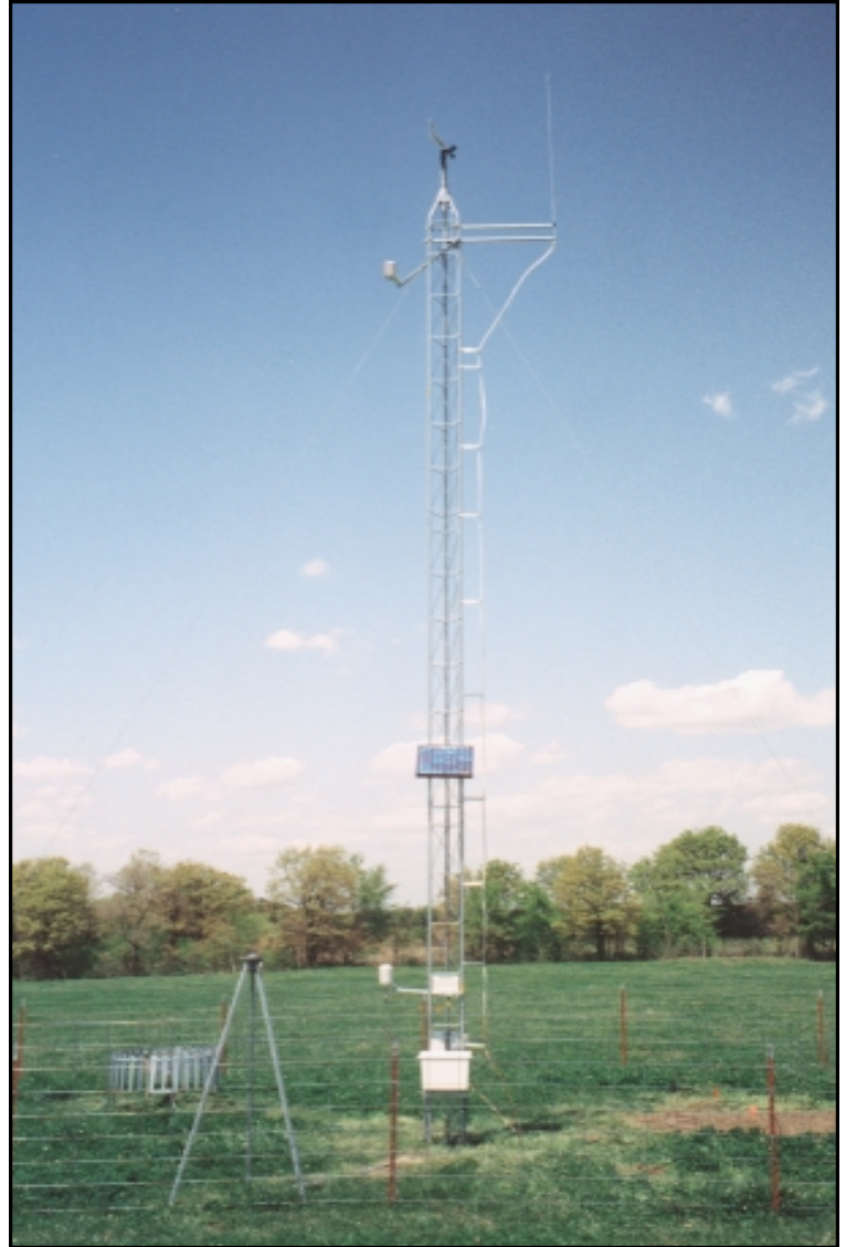
A Mesonet station at Eufaula, Oklahoma, is one of 114 automated weather stations that continuously measure weather conditions.

Air and soil temperature, RH, wind speed and direction, barometric pressure, solar radiation, rainfall, soil moisture