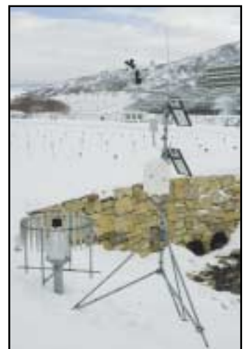
A station stands at Soldier Hollow Stadium, venue for the biathlon, all cross-country skiing events and the nordic combined.

Managed by the Salt Lake Organizing Committee