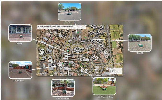
Map of campus measurement points