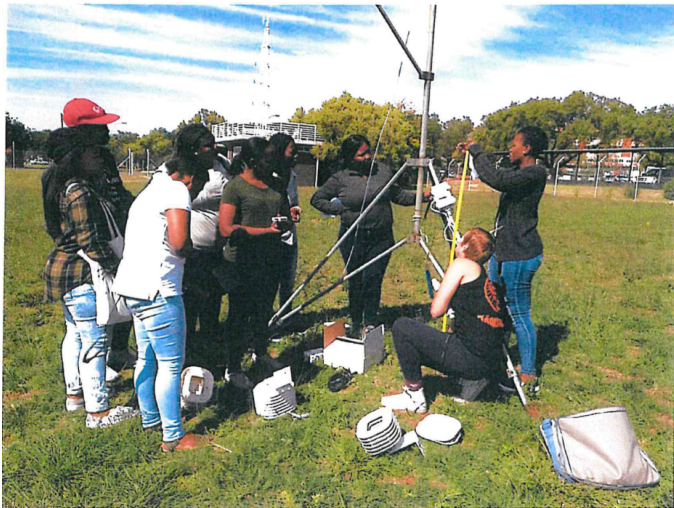
Students trained in field instrumentation installation