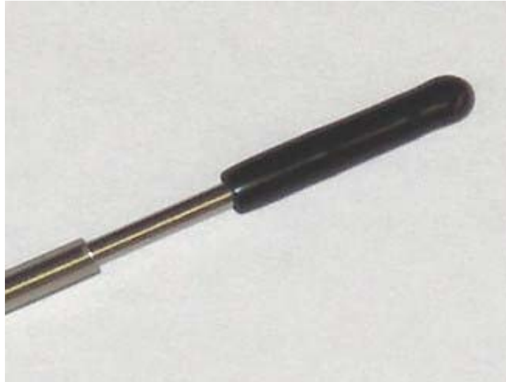
Figure 2: C1420 Connector Tube