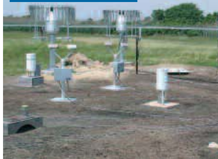
Wallops Island, VA, USA