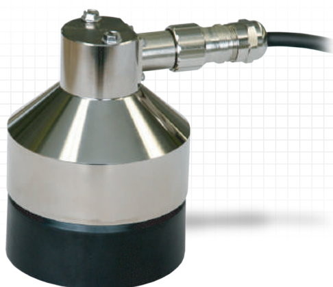
SR50A (aluminum chassis)