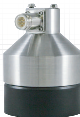
SR50A-316SS (stainless-steel chassis)