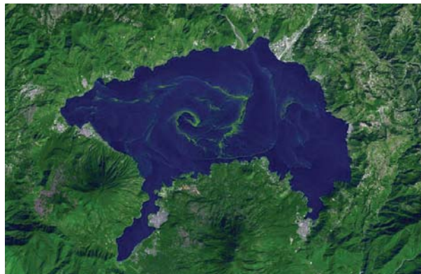
Satellite image of a cyanobacteria bloom

Phytoplankton are microscopic, free-floating photosynthetic plants and bacteria that are commonly found in surface waters throughout the world. Aquatic scientists and water resource managers measure phytoplankton to gain insights on ecological dynamics, ecological health, nutrient status, and harmful algal bloom potential in aquatic systems. Submersible fluorescence sensors help to make this measurement easy, efficient, and economical by enabling real-time field estimates of phytoplankton biomass that can be directly correlated to standard laboratory quantitative measurements.