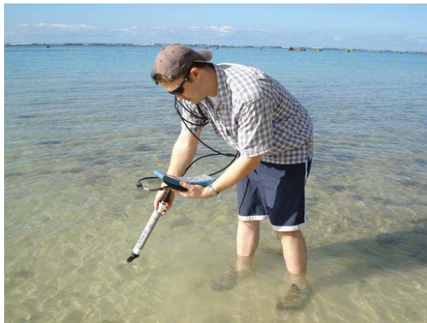
Real-time in vivo phytoplankton measurement using fluorescence sensors on a Hydrolab sonde

Fluorescence can be described as the phenomena of certain molecules or compounds that absorb specific wavelengths of light and instantaneously emit energy wavelengths of light. Relevant to the topic of phytoplankton measurement, chlorophyll, phycocyanin, and phycoerythrin are all fluorescent pigments that can be measured using fluorescence instrumentation. Fluorescence measurements of these pigments can be made in vitro (“within the glass”) in the laboratory and in the field with submersible in vivo (“within the living”) fluorescence sensors.