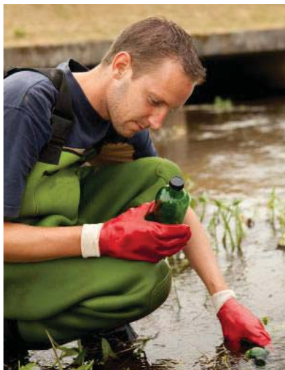
A representative grab sample is used as a primary standard for in vivo phytoplankton measurement

In vivo phytoplankton sensors require a two point calibration, including a blank (de-ionized water or filtered sample water), and a non-zero standard. Unlike sensors for pH, conductivity, and turbidity, there are no bottled primary calibration standards readily available for in vivo phytoplankton as this analyte is part of a living biological organism. A representative grab sample from the environment is actually the true standard for in vivo phytoplankton monitoring; it just requires an additional step of in vitro laboratory quantification if meaningful concentration units are desired.