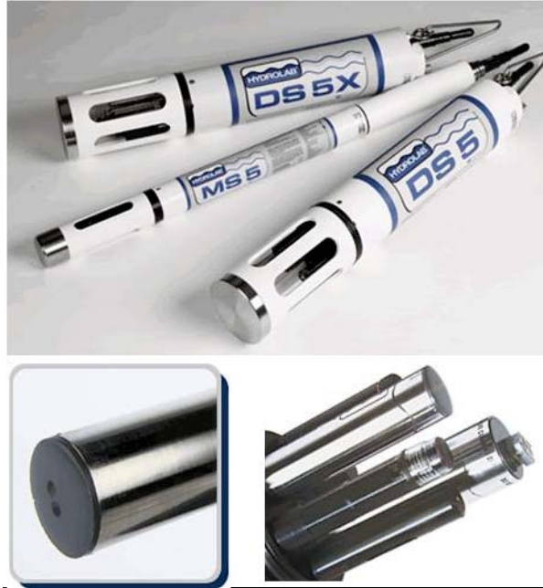
Hydrolab sondes and sensors. Fluorescence sensor shown on bottom left

In vivo chlorophyll a is typically the most commonly deployed sensor among the three in vivo phytoplankton fluorescence sensors offered on Hydrolab sondes, followed by phycocyanin and phycoerythrin. The optics on the in vivo chlorophyll a sensor are specifically aligned with the in vivo fluorescence signature of the chlorophyll a pigment. This optical configuration provides in vivo data that is directly relevant to extracted chlorophyll a measurements, which is important considering that EPA standard methods are specifically based on chlorophyll a pigment concentrations.