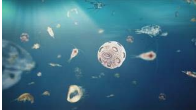
Phytoplankton come in many different shapes, sizes, and colors

Pigments provide a vital function by absorbing light energy needed for photosynthesis. In this process, light energy from the sun drives a reaction where carbon dioxide and water are converted into sugars. Oxygen is given off as a reaction byproduct. As phytoplankton are able to create their own chemical energy through this process, they are commonly referred to as “primary producers” within aquatic ecosystems. These primary producers form the foundation of aquatic food webs, where they are consumed by organisms higher up on the food chain, such as zooplankton, invertebrates, and fish.