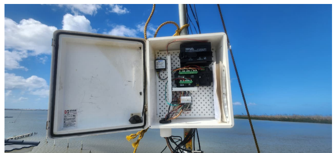
Inside the weather station enclosure