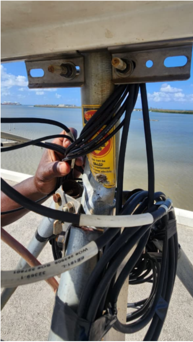
The bent center mast after the station survived the hurricane