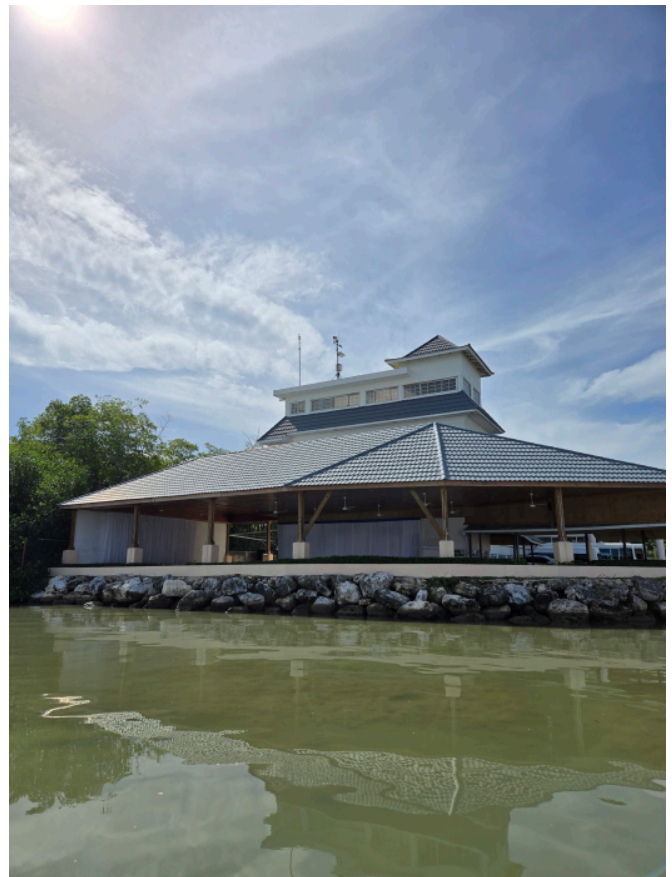
The automated weather station bolted to the roof of the Glistening Waters Hotel