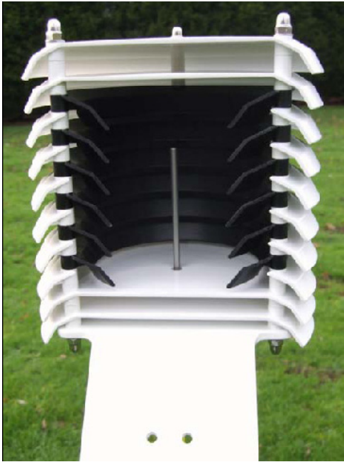
A cross-sectional cutaway showing the external and internal louvers of the larger capacity MET20 shield