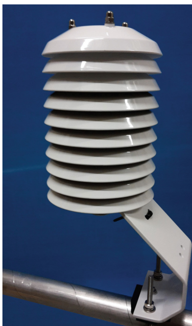
RAD 10 radiation shield

Operating temperature range -55 to 65 °C