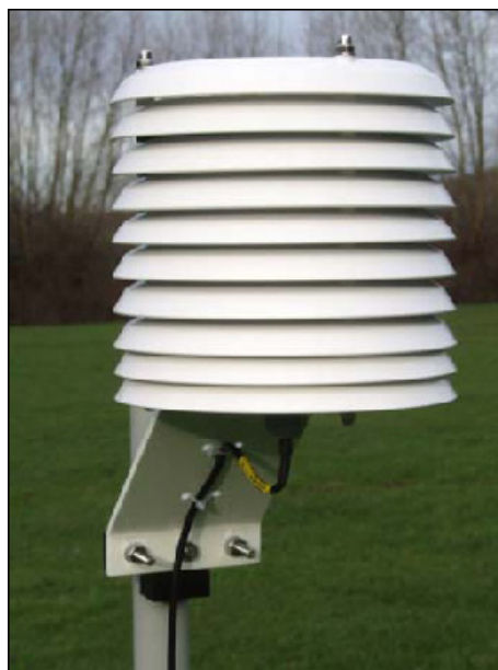
The MET 20 Unaspirated radiation shield