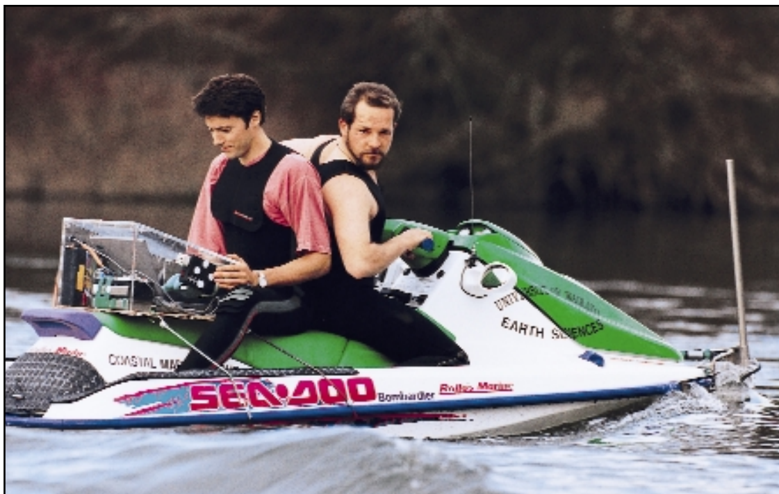
The University of Waikato's Seadoo-based system measures and records water depth versus geographic position, making the system ideal for surf-zone bathymetry.

Campbell Scientific dataloggers prove their worth down under