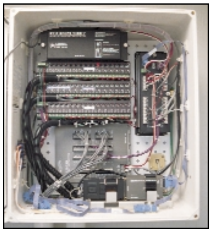
A CR10X datalogger (right), AM416 multiplexer (top) and three SDM-CD16AC relays monitor and control 12 fish tanks.

n August 1996, Stolt Sea Farm (www.stoltseafarm.com) installed a Campbell Scientific, Inc., monitoring and control system at its recir-