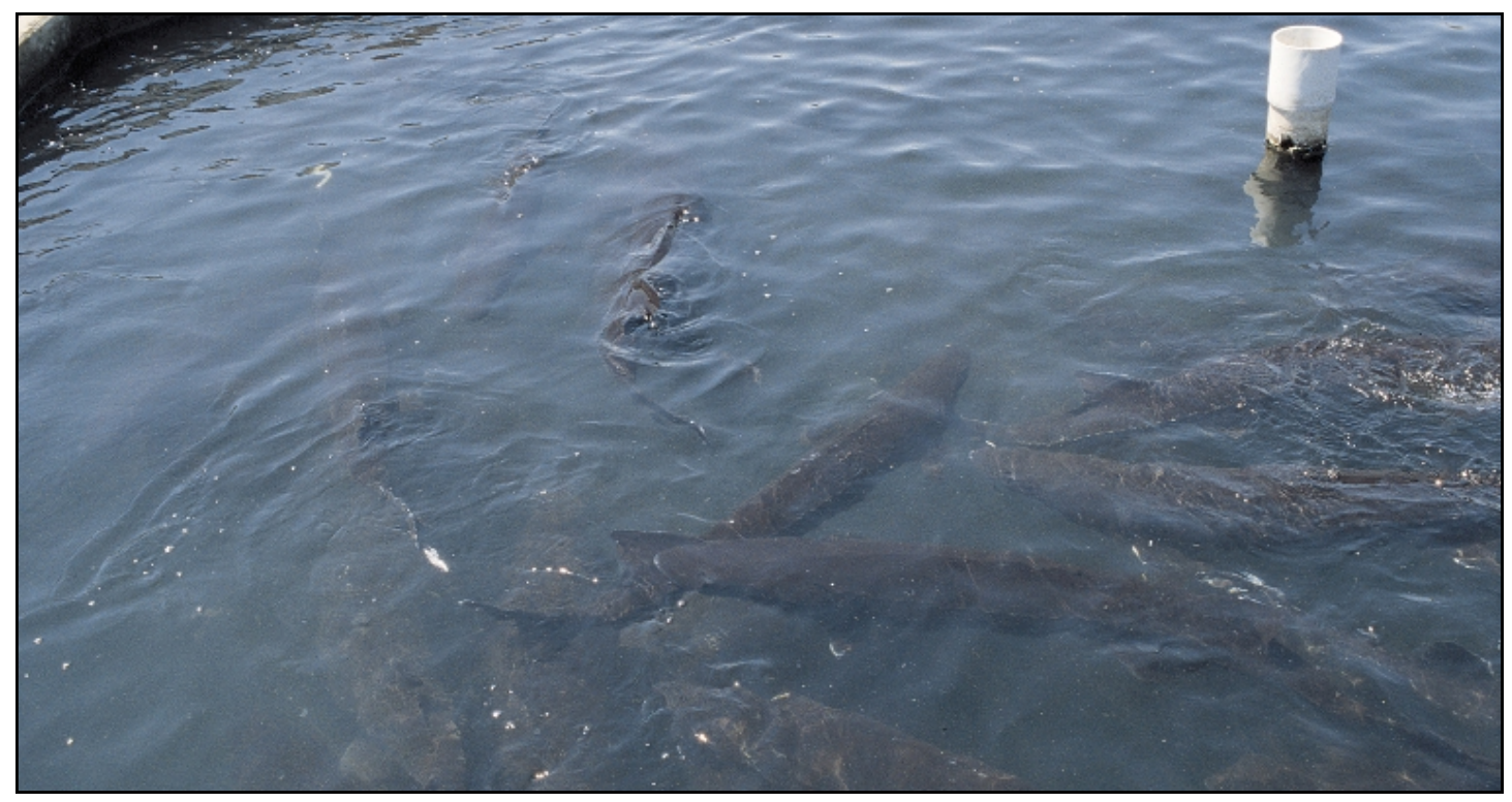
Sturgeon, raised from eggs, spend eight to 10 years in monitored Stolt Sea Farm tanks before roe is processed into caviar for a world market.