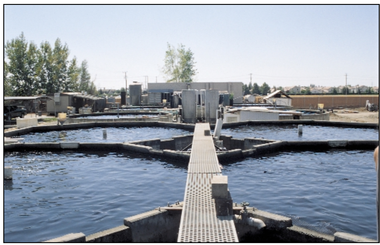
A Campbell Scientific system continually monitors and controls water quality in each of 12 individual tanks at the Stolt Sea Farm facility in Elk Grove, California. The tanks house sturgeon, raised to produce premium caviar.

With perfection as the rule, caviar producer turns to CSI