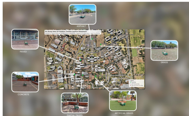
Map of campus measurement points

Our thanks go out to Abdul, as we couldn't have summed this up better!