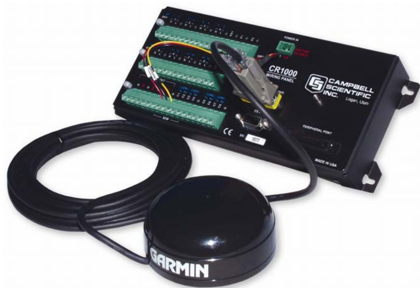
FIGURE 3. CR1000 to GPS16-HVS Using the 17218 Adapter