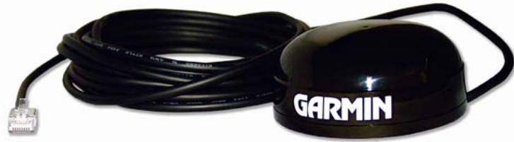
FIGURE 1. Garmin 16-HVS GPS Receiver, Part Number 17215