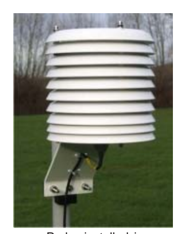
Probe installed in MET20 Radiation Shield

Red: constantan (low) Yellow: shield (ground) Purple: chromel (high)