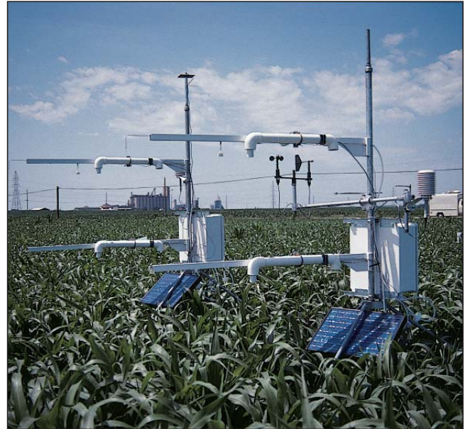
These Bowen ratio systems at a sorghum field near Lincoln, Nebraska include ASPTCs attached to the upper and lower Bowen ratio arms.

Note that our CR200(X)-series, CR510, and CR500 dataloggers are not compatible with thermocouples, and therefore cannot be used to measure the ASPTC.