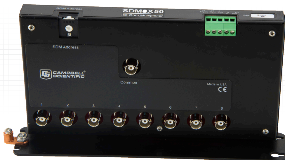
SDM8X50 (strain relief bracket not shown)