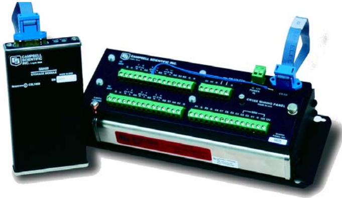
Illustration shows SM4M storage module connected to a CR10X datalogger