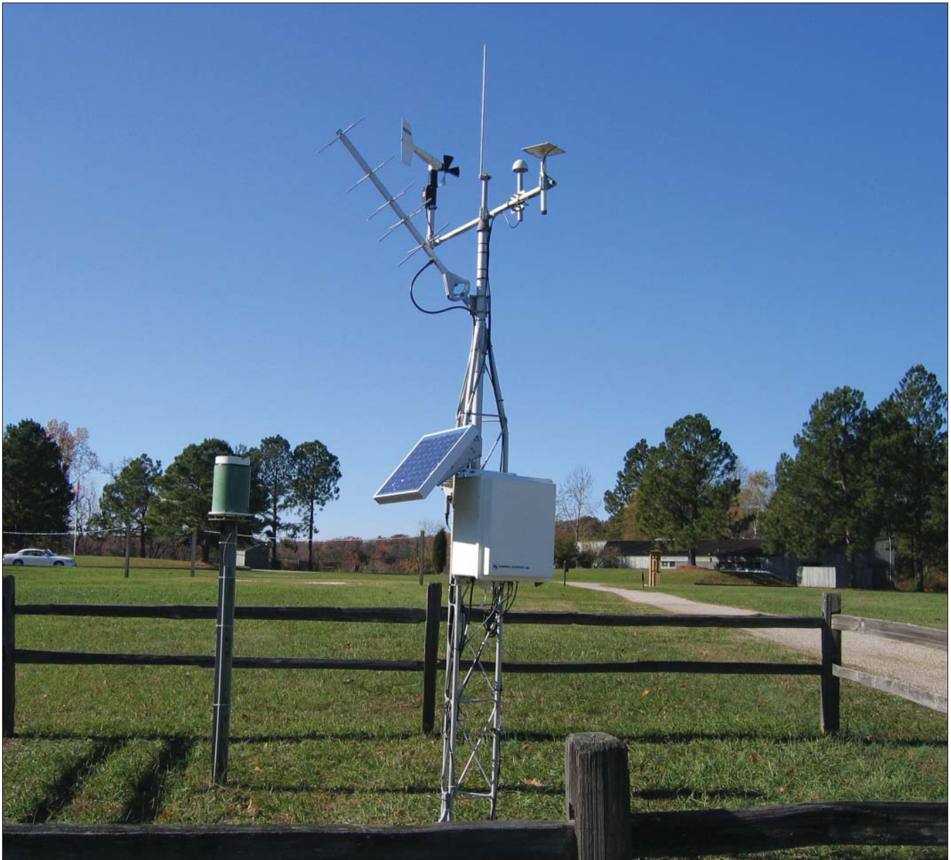
The National Estuarine Research Reserve (NERR) in Virginia uses a UT10 tower to support their meteorological sensors, solar panel, environmental enclosure, and antennas.

The UT10 is used as a sturdy, long-term instrument mount for a variety of applications. It can be augmented with mounts (e.g., CM204, CM220, CM225) that allow attachment of meteorological sensors such as wind sets, pyranometers, and temperature/relative humidity probes. Other meteorological sensors such as barometers, soil temperature and moisture probes, and rain gages can also be used with a UT10-based station.