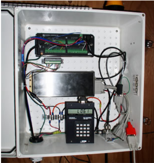
Enclosure with CR10X and MCC low-band radio