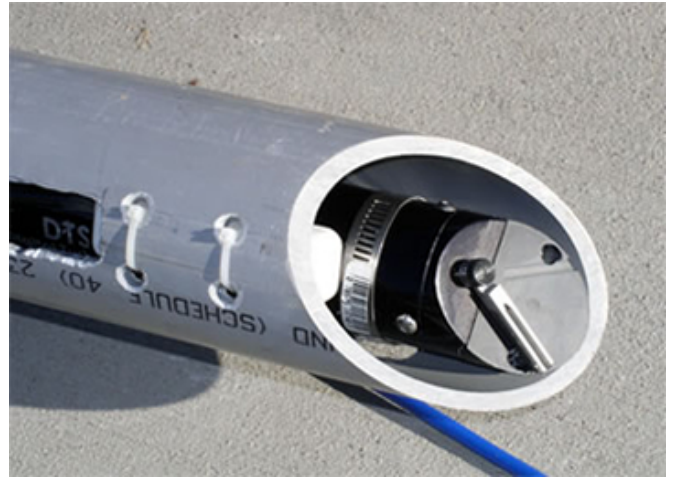
Face of the sensor stand insert showing DTS-12 and CS547